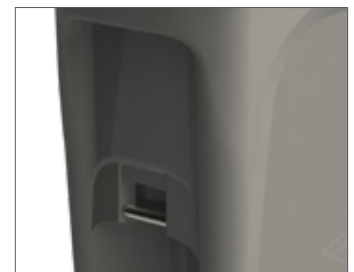
New hidden handle Nestable design with catch bar

Colours (standard) Other colours available upon request