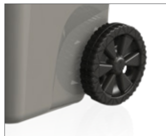
Silent Dual TPE-rubber and plastic wheels offered in 10" & 12" Wheels snap on without tools