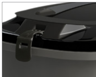
Optional MantisWay latch