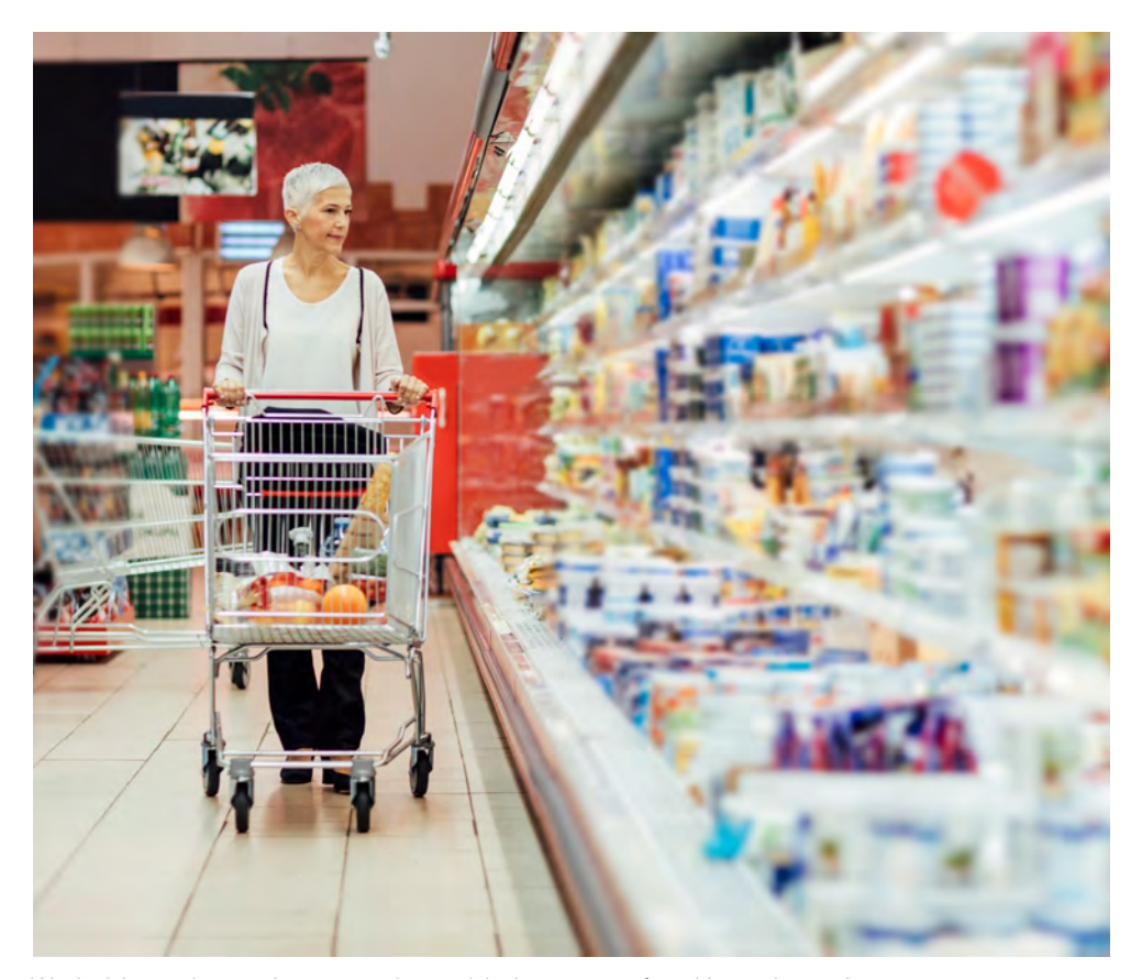
We don't just make containers, we understand the importance of reaching and attracting your customers at the point of purchase.