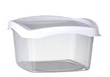
Mod.: 21150 32 oz. - (1 L) 5.73" (W) X 2.94" (H)