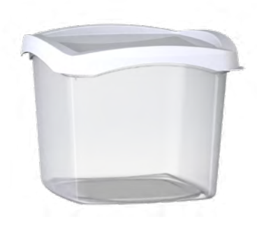
Mod.: 21550 48 oz. - (1.5 L) 5.73" (W) X 4.33" (H)