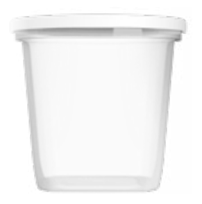
8 oz. - 250 ml 4,600" (D) X 1,743" (H)