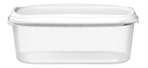
| Mod.: 21188 (with original lid) 32 oz. - (1 L) 7.5" x 4.97" (LxW) X 2.72" (H)