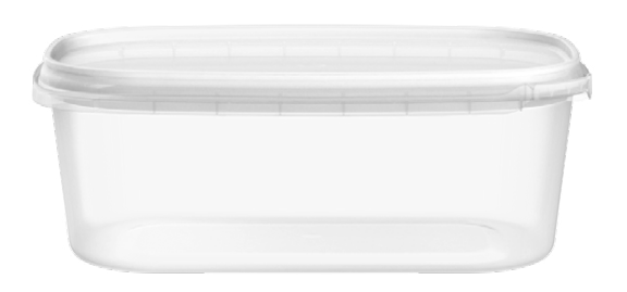
| Mod.:21189 (with performance lid) 32 oz. - (1 L) 7.5" x 4.97" (LxW) X 2.72" (H)