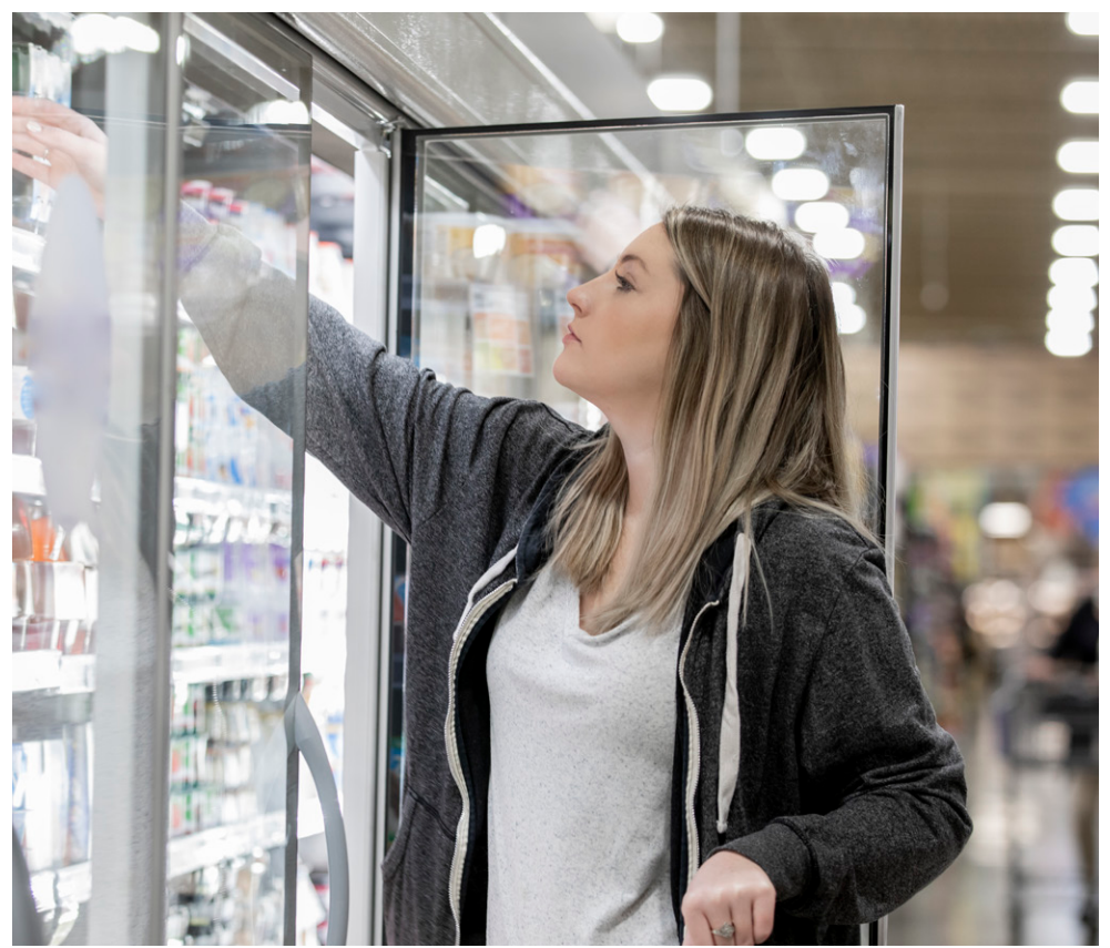
We don't just make containers, we understand the importance of reaching and attracting your customers at the point of purchase.